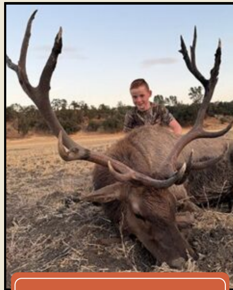
California Tule Elk